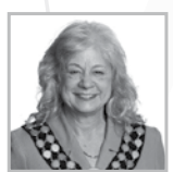
Sue Heins Mayor Northern Beaches Council