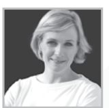
Zali Steggall OAM MP Federal Member for Warringah