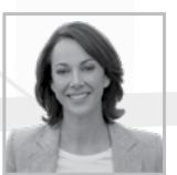
Dr Sophie Scamps MP Federal Member for Mackellar